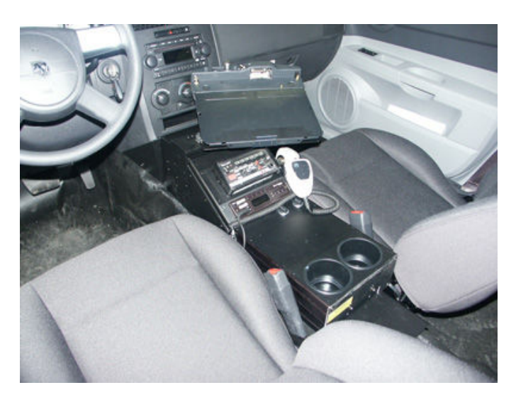
Route wiring and install emergency controls and accessories